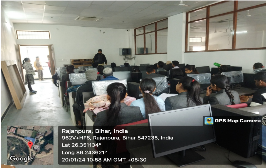
Pic 1- The first half of the session conducted by Prof. Gaurav Kumar

Photograph (Geotag/ No-geotag) with caption written below