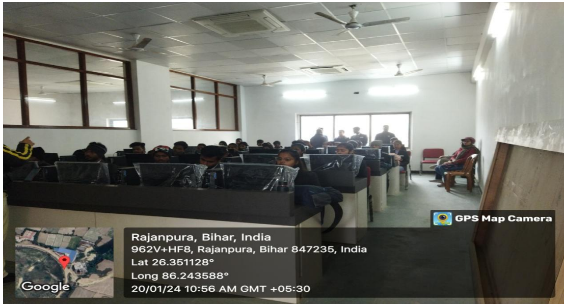
Pic 3- Showing students keen interest in the session.